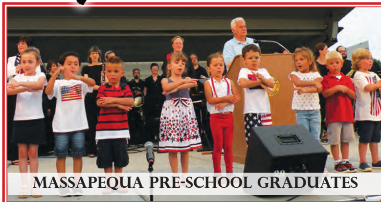
MASSAPEQUA PRE-SCHOOL GRADUATES