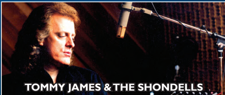
TOMMY JAMES & THE SHONDELLS