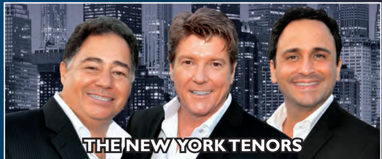
THE NEW YORK TENORS