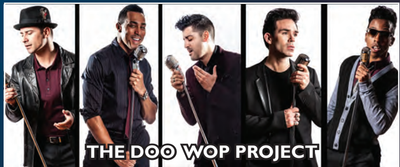
THE DO@WOP PROJECT