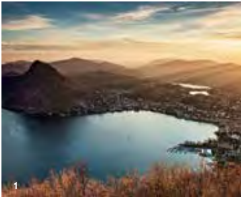
1. Lugano, Ticino 2. Motto della Croce, between Bellinzona and Lugano, Ticino

Monte Brè , cable car and artists' village of Brè with the "Kunstweg" (art trail), Monte Bar , Capanna Monte Bar with speciality dishes of the Ticino region, Rivera , bathing fun and wellness in the Splash & Spa Tamaro, Monte Tamaro , Chiesa di Santa Maria by Mario Botta and Adventure Park, Malcantone , relax in the popular Laghetto di Astano