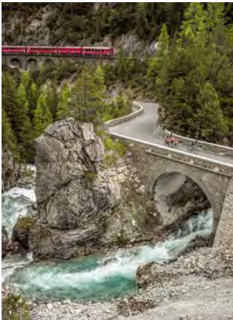
1. Albula Pass, Graubünden 2. Lake Davos, Davos, Graubünden