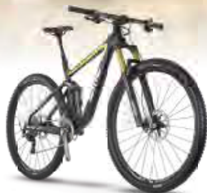
speedfox 01 XTR

For nimble mountain goats and downhill junkies alike, the new speedfox does it all, guaranteeing that the adventurous element to mountain biking remains the focus of every ride. Efficient and light, this bike is capable of handling the most demanding trails.