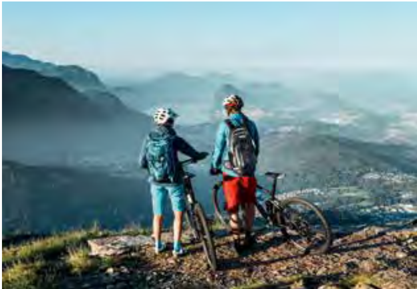
Explore the surrounding area with Rent a Bike

You can of course take your own bike with you wherever you go. It's easier to rent a bike or e-bike at your starting point and return it where the tour ends: from Rent a Bike at over 70 railway stations throughout Switzerland.