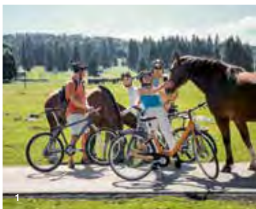
1. Le Bemont, Franches Montagnes, Jura & Three-Lakes 2. Doubs Bridge, St-Ursanne, Jura & Three-Lakes

♡ Saignelégier–La Chaux-de-Fonds. Webcode 230000