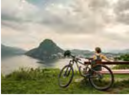
Fun and exercise in a breathtaking landscape