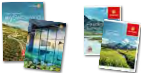
Summer Holidays Magazine 2016, Cities and Art Magazine 2016